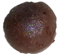
Sugar Cookie Dough