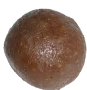
Sea Salt Caramel