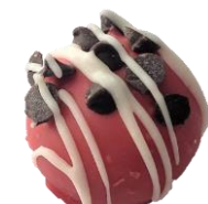
Cherry Almond Chip

Seasonal flavors may be available as well!