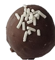
Black and White