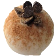
Stuffed French Toast