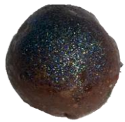
Brandy Old Fashion