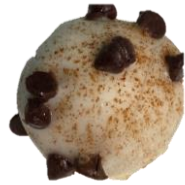
Stuffed French Toast