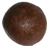
Sea Salt Caramel