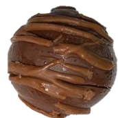
Peanut Butter Chocolate