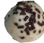
Black and White