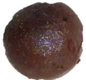
Sugar Cookie Dough