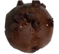
Chocolate Chip Cookie Dough